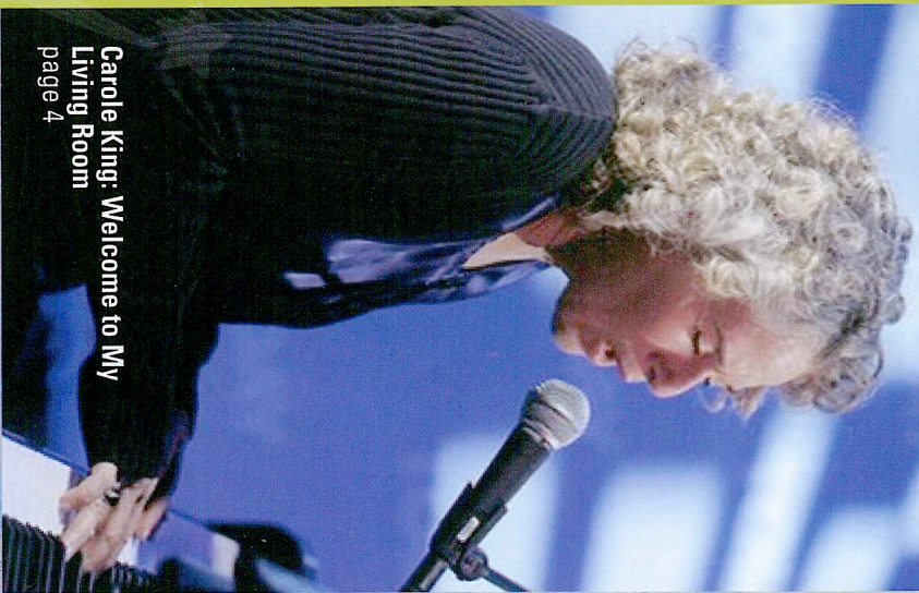
Carole King: Welcome to My Living Room page 4