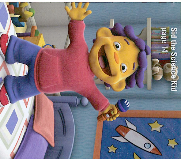
Sid the Science Kid page 14